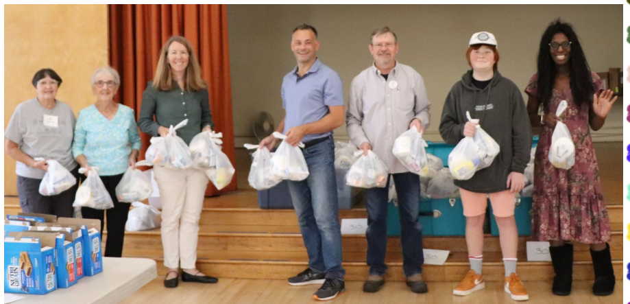
2023 Service Sunday—JUMP Hygiene Kits.