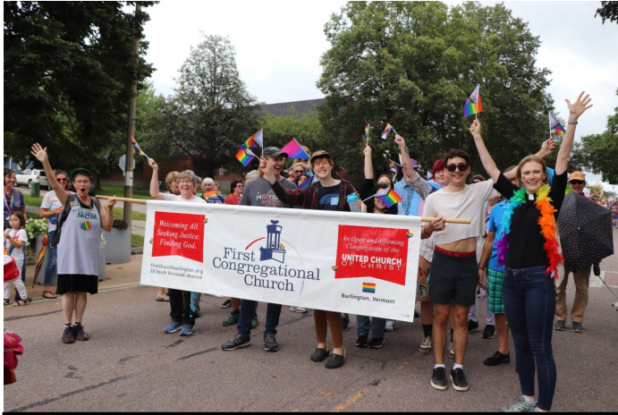
FCC at the 2023 Burlington Pride Parade.

We seek to connect visitors, congregants, and the greater Burlington community with the people and work of First Church. But how do we put this mission into practice?