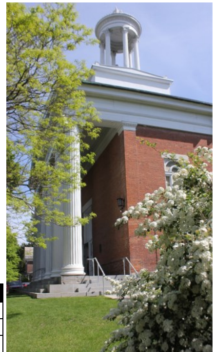
Spring 2023—FCC Building, Front Portico.