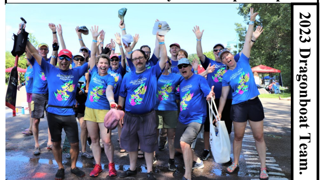
2023 Dragonboat Team.