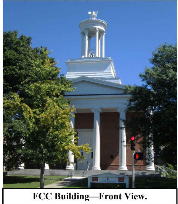
FCC Building—Front View.