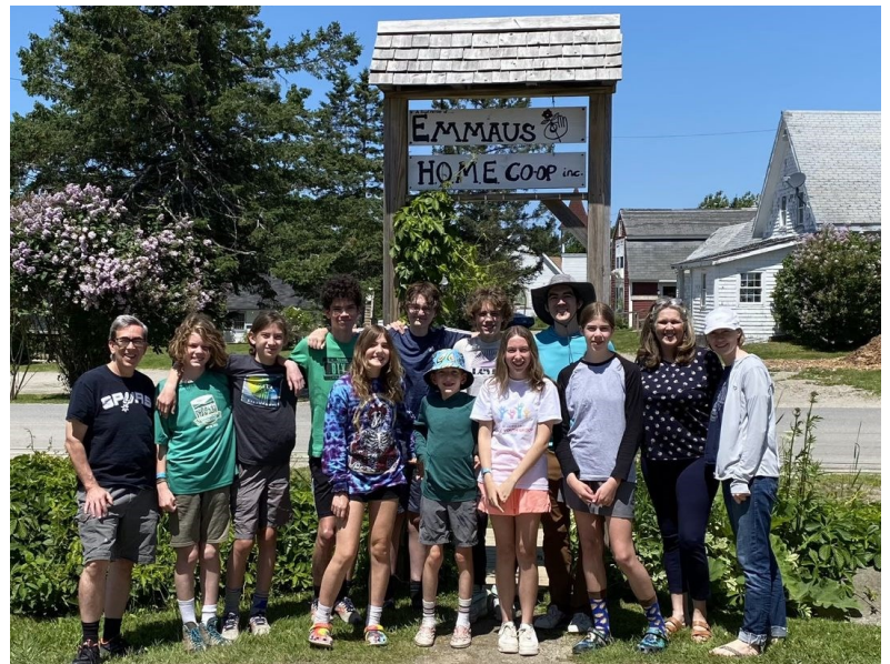
June 2023—Middle and High School Youth Trip to Maine to serve with HOME, Inc.