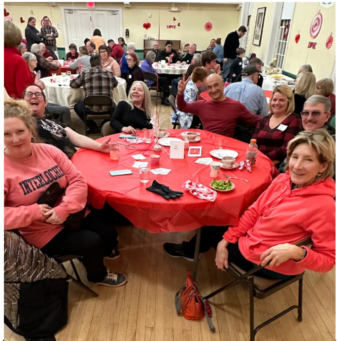
2023 Valentines Auction & Dinner.