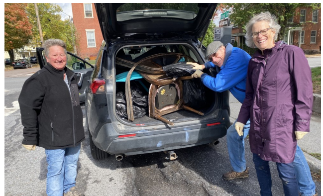
2023 Service Sunday - Trash pick-up.