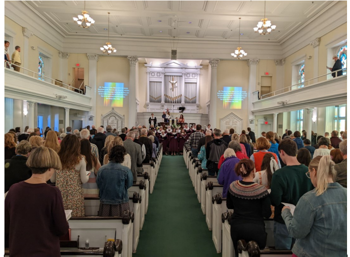
2023 Easter - Singing in the Sanctuary.