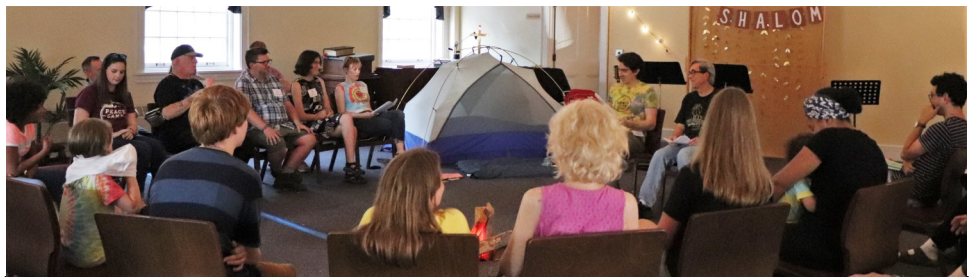
2023 Peace Camp - Children & Adults.