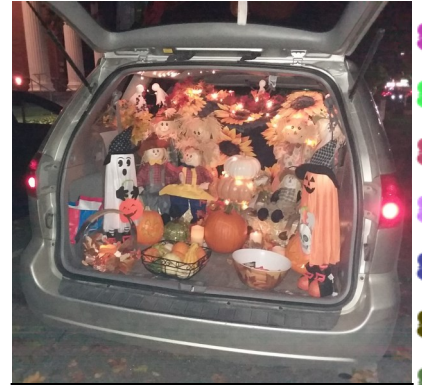
2023 Trunk or Treat.

We have a small but mighty team which is very busy behind the scenes so that, together, we will continue to grow the church. We developed a new visitor process providing Radical Hospitality to our new visitors through a warm and friendly welcome. New visitors, or church shoppers, regularly come to FCCB and they will decide within 7 minutes if they intend to return...7 minutes! You will see our Welcomers on Sunday morning holding up signs at the Midway and Narthex, greeting everyone, especially our new visitors. We encourage all members to give a warm greeting to new people each and every time you meet them. And everyone please wear your Name Tags, they make a difference! [Continued on other side.]