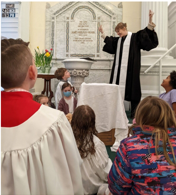
Easter 2023—Children's Storytime.